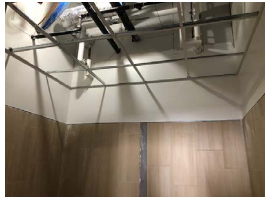
Ceiling Grid and Tile at the YMCA