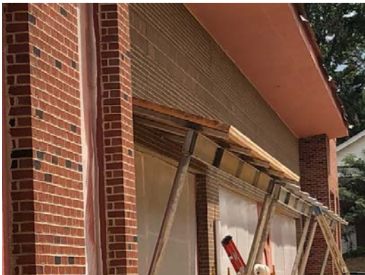
Cedar T&G at overhangs on YMCA