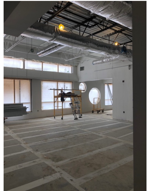
Classroom at the YMCA