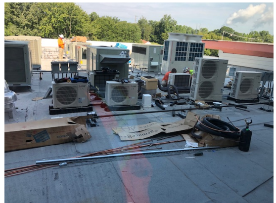
Outdoor condensing unit install at WPA