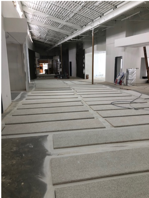
Tectum panels at the YMCA